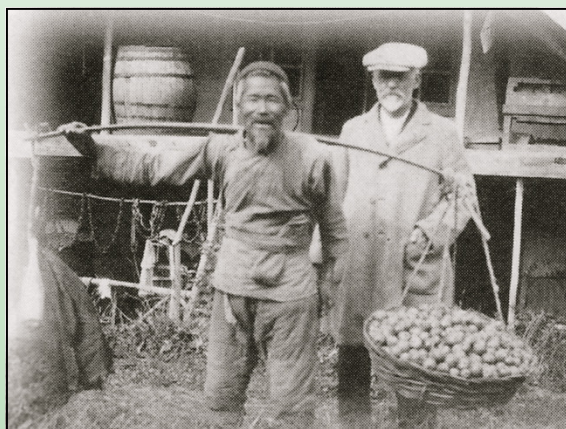
Collecting Pears in Harbin, China.