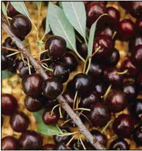
Hansen's Bush Pie Cherry